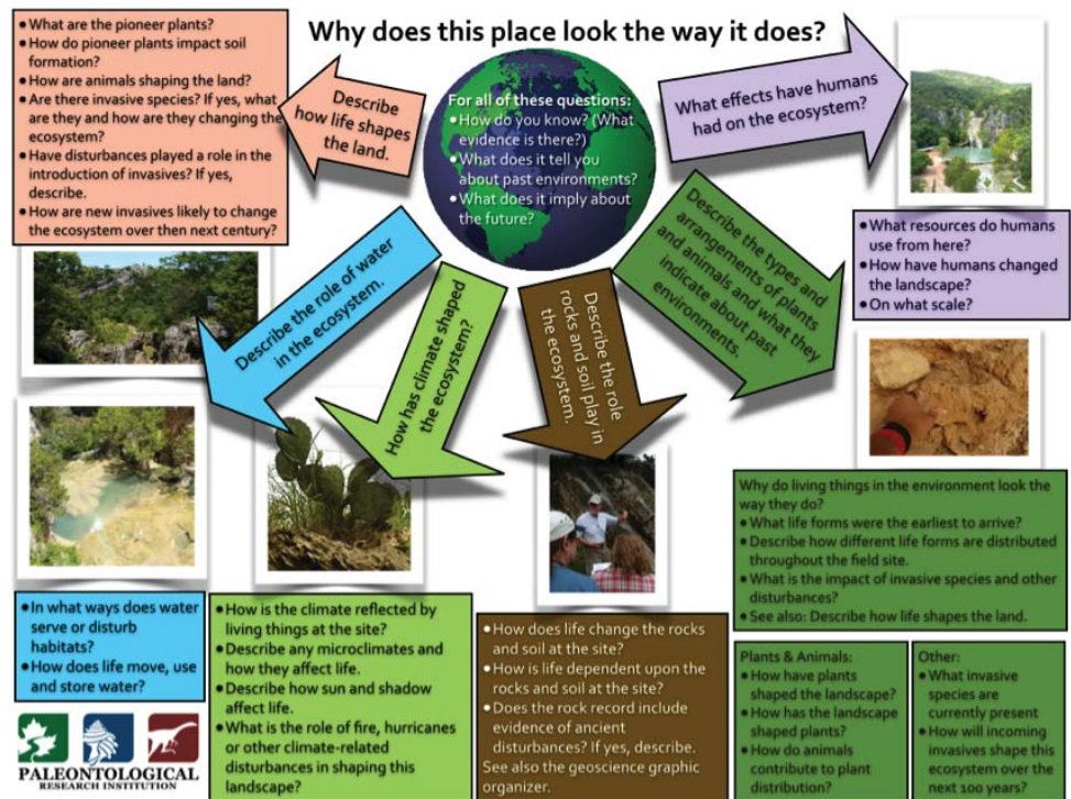
Figure 11.1: This pair of graphic organizers shows various paths of inquiry that stem from the question: Why does this place look the way it does? The top graphic focuses upon the geosciences, and the bottom focuses upon the environmental sciences. The questions within the diagrams are also included as printable checklists in the section “Back in the Classroom.”