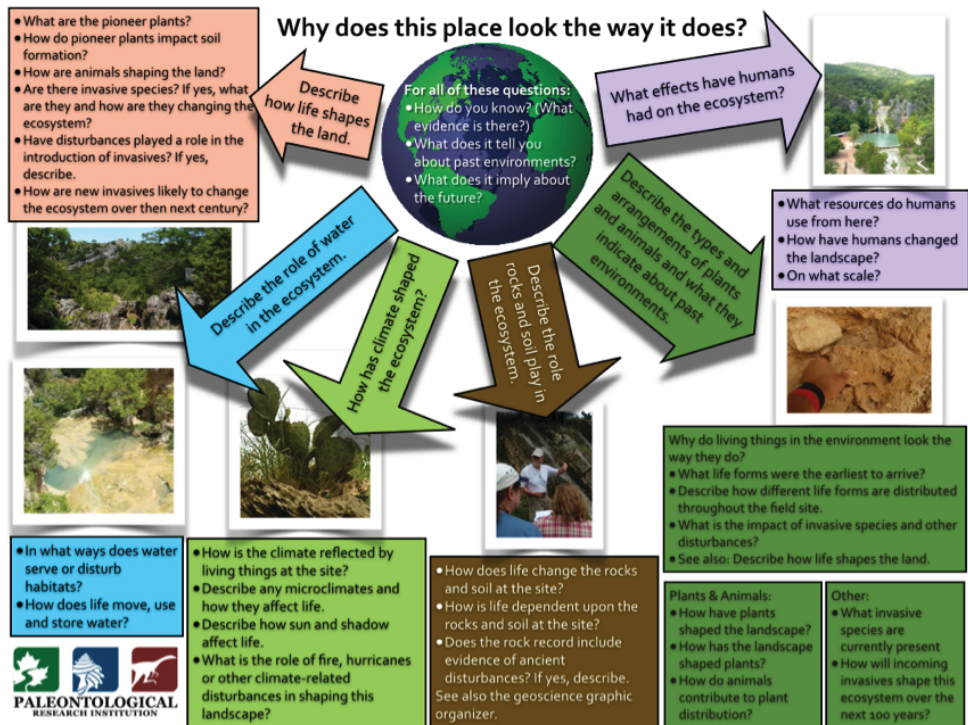
Figure 11.1: This pair of graphic organizers shows various paths of inquiry that stem from the question: Why does this place look the way it does? The top graphic focuses upon the geosciences, and the bottom focuses upon the environmental sciences. The questions within the diagrams are also included as printable checklists in the section “Back in the Classroom.”